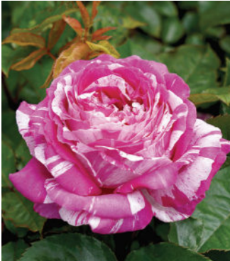
Code/Name: Pink Illusion Type: Hybrid Tea Breeder: W. Kordes', Germany (Treloar Roses)