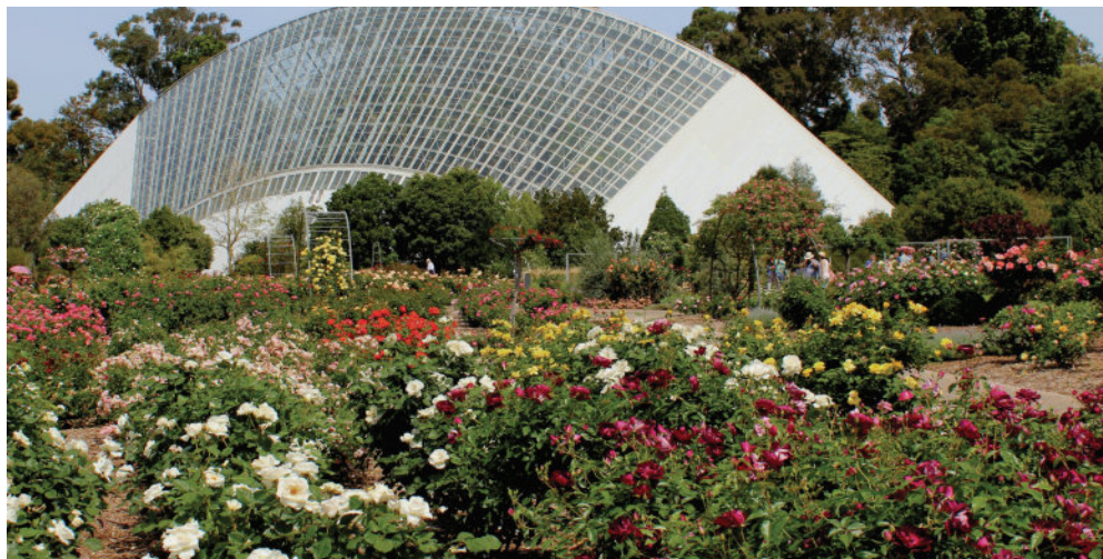
Roses in the Adelaide International Rose Garden have benefited from Sudden Impact for Roses

A word of warning is required here because the operative procedure is summer trimming. It is sometimes wrongly referred to as summer pruning and the inexperienced grower must resist the temptation to cut too heavily.