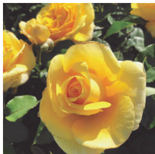
Lady of Australia Image: Benedetta Rusconi