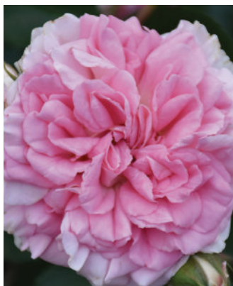
Code/Name: You Are My Sunshine Type: Climber Breeder: Laurel Sommerfeld, Australia