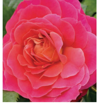
Code/Name: Dancing Ayoba Type: Floribunda Breeder: W. Kordes', Germany (Treloar Roses)