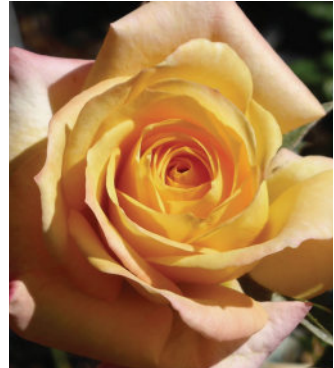
Code/Name: Walfight First Light Type: Miniature Breeder: Richard & Ruth Walsh, Australia