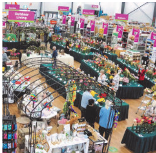
View of the show from upstairs of 'Cafe de Grove'