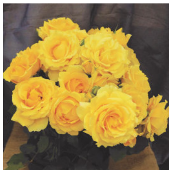
'B' Champion Bowl of Roses