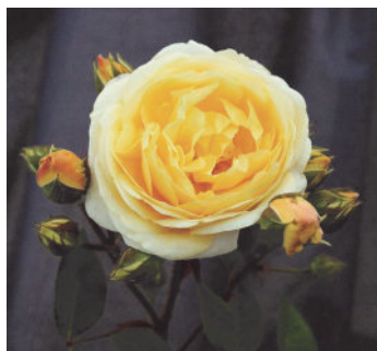
'B' Champion Shrub/ Polyantha Rose