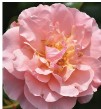
Code/Name: Twiggys Rose Type: Floribunda Breeder: Harkness Roses, UK (Knight's Roses)