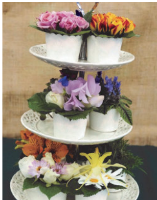
'B' Grade Champion Floral Arrangement