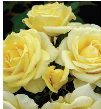
Code/Name: KORmonali Type: Floribunda Breeder: W. Kordes', Germany (Treloar Roses)