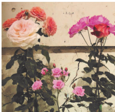
Uraidla Championship: Various