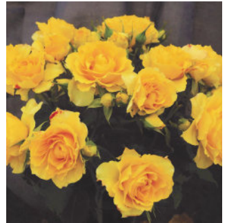
'Open' Champion Australian Bred Bunch