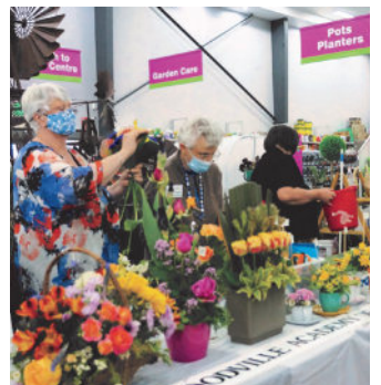
Members of Woodville Academy of Floral Design were kept busy making arrangements for sale