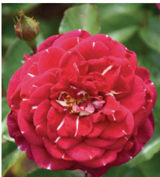
Code/Name: T53 C Type: Hybrid Tea Breeder: Harkness Roses, UK (Knight's Roses)