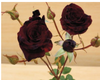
B Grade: Black Beauty Les Johnson