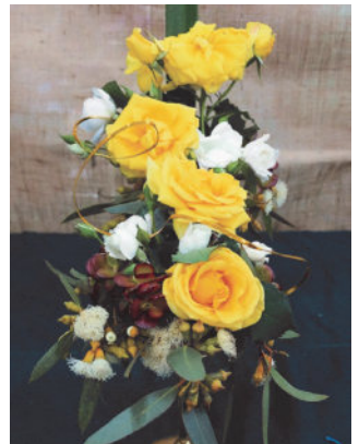
'C' Grade Champion Floral Arrangement