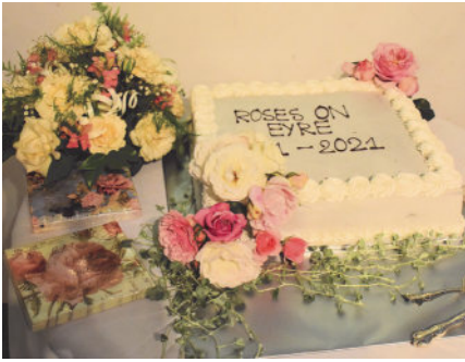
Celebratory cake decorated with Souvenir de Louis Amade, Icebergs – pink & white – & Bonica