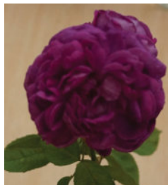
Pre 1900 Old Garden Roses: Reine de Violettes K. & G. Moxham