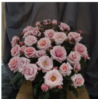
'A' Champion Bowl of Roses