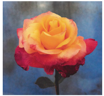
Champion Non RSSA Member 'Tea Tree Gully Garden Club'