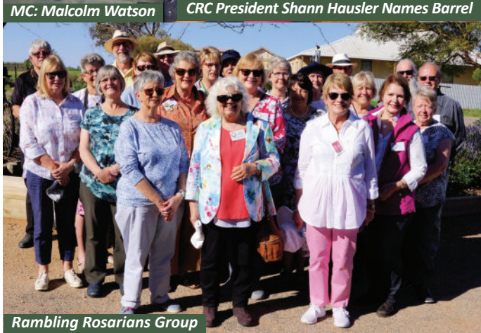
Rambling Rosarians Group