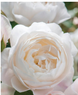
Code/Name: Desdemona Type: Shrub Breeder: David Austin Roses, UK