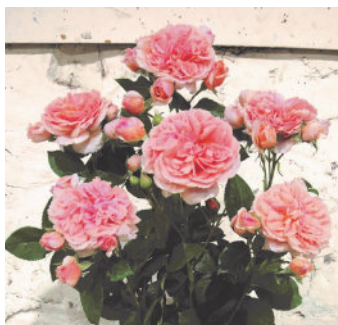
Elysium Fields 20