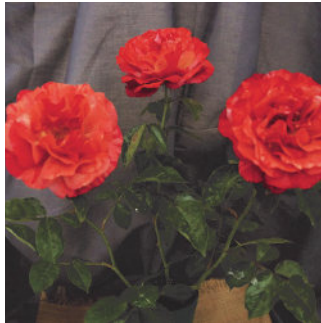
'Open' Champion of Sundry Classes The Royal National R.S. #2