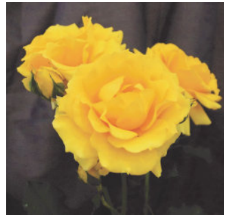
'C' Champion 3 Stems/ Cuts