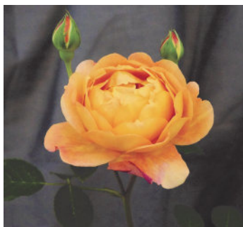
'A' Champion Shrub/ Polyantha Rose