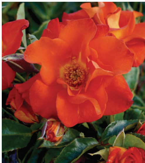
Code/Name: KORkaans Afrikaans Type: Floribunda Breeder: W. Kordes', Germany (Treloar Roses)