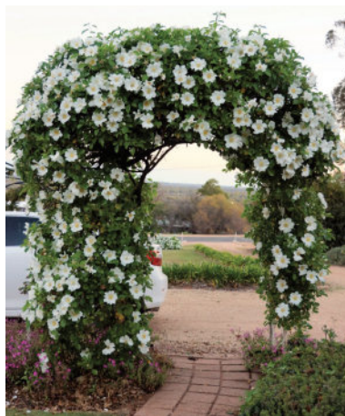
rosa Laevigata AKA The Cherokee Rose