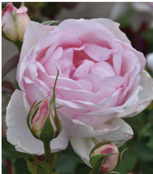
Code/Name: 4038 Jessica's Rose Type: Hybrid Tea Breeder: Bruce Brundrett, Australia