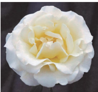
'B' Champion Full Bloom Rose Exhibitor: P. Schulz Rose: French Lace