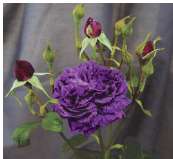
'C' Champion Shrub/ Polyantha Rose