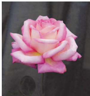
'A' Champion Exhibition Rose Allan Campbell Trophy Exhibitor: G. Woods Rose: Silver Lining