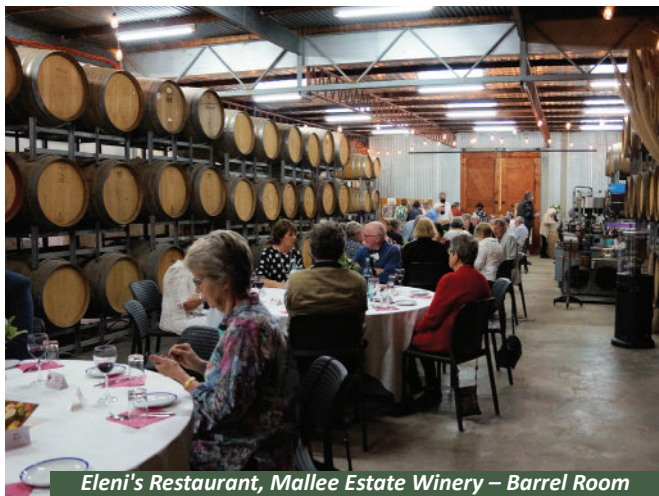
Eleni's Restaurant, Mallee Estate Winery – Barrel Room