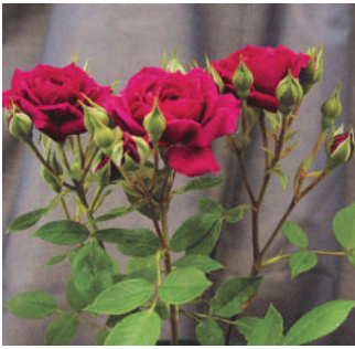
'A' Champion 3 Stems/ Cuts