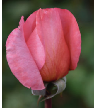
Code/Name: 5652 06 2 Type: Hybrid Tea Breeder: Meiland International, France (Corporate Roses)