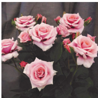
'A' Champion Bunch of Roses