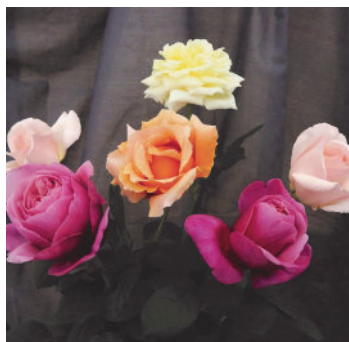
'C' Champion Bunch of Roses