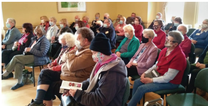
Members who attended the meeting at Urrbrae House