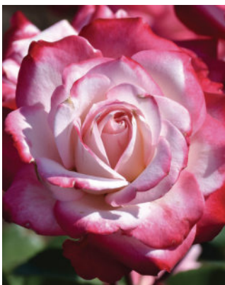
Code/Name: 6171 06 E Type: Floribunda Breeder: Meilland International, France (Corporate Roses)