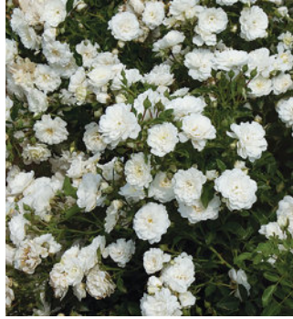
Code/Name: BAR 7117 Cometa Type: Ground Cover Breeder: Rose Barni, Italy (Wagner's Rose Nursery)