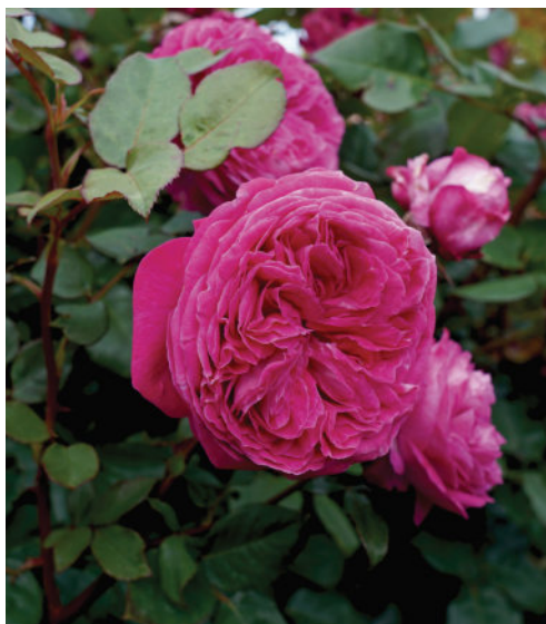
Code/Name: KORbevmahe Delightful Parfuma Type: Floribunda Breeder: W. Kordes', Germany (Treloar Roses)