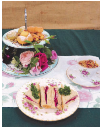
'A' Grade Champion Floral Arrangement Rose A Thomas Memorial