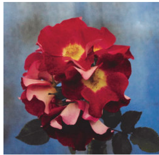
Champion Non Member General Public Exhibit