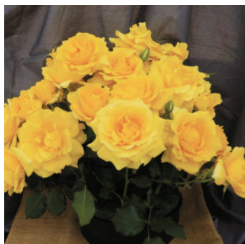
'C' Champion Bowl of Roses