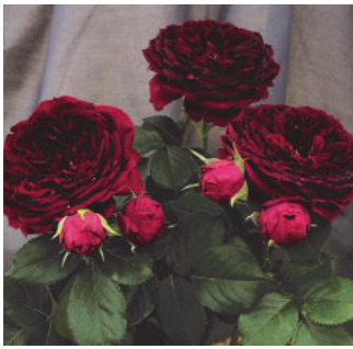
'Open' Champion Australian Bred Stem/Cut