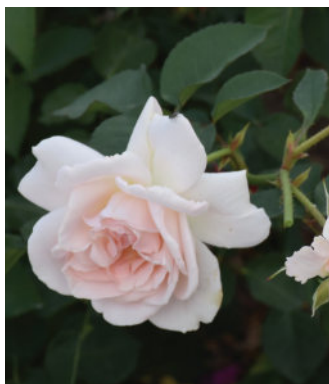
Code/Name: 7030 Type: Hybrid Tea Breeder: Bruce Brundrett, Australia