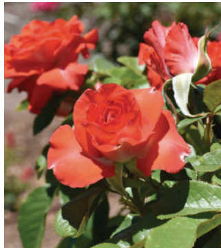
Code/Name: T272 1 Type: Floribunda Breeder: C. Bedard, Weeks Roses, USA (Swane's Nurseries)