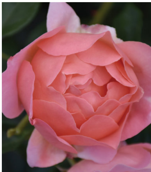
Code/Name: KORravreli Heaven On Earth Type: Floribunda Breeder: W. Kordes', Germany (Treloar Roses)