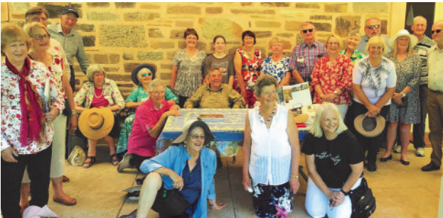
At The Heritage Garden