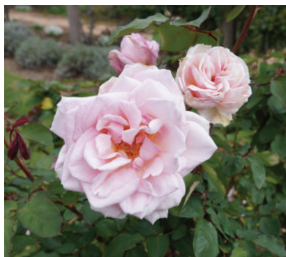
'Aussie Bred' Judy's Song