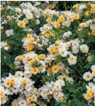
Code/Name: BAR 6992 Sungirl Type: Ground Cover Breeder: Rose Barni, Italy (Wagner's Rose Nursery)