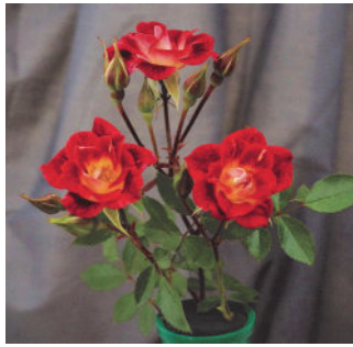
'B' Champion 3 Stems/ Cuts