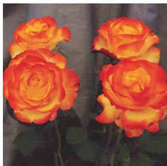
'B' Champion Bunch of Roses