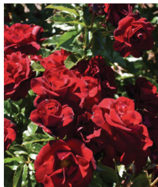
Code/Name: N 293 A Type: Floribunda Breeder: Harkness Roses, UK (Knight's Roses)