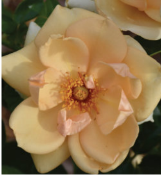
Code/Name: 7008 Type: Floribunda Breeder: Bruce Brundrett, Australia