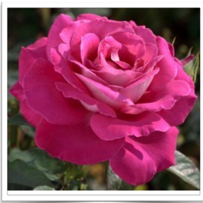
Left: 'Maria Callas'® (MEI daud), 1956 cross, registered in 1965 (In the US, 'Miss All American Beauty'™ registered in 1967), AARS winner 1968, Right: 'Baronne Edmond De Rothschild'®, (MEIgriso), 1959 cross, registered 1969