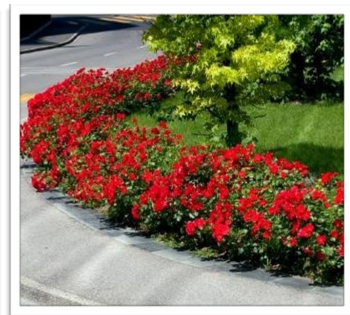
Left: 'Charles De Gaulle'® (MEI lanein), 1966 cross, registered 1976, Right: 'La Sevillana'® (MEI gekanu), the first MEIDILAND® shrub cross from 1969, registered in 1978