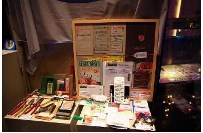
Left: World Rose Museum, Daxing, China, Right: Documents from the Laperrière archives