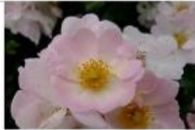
SILBERMEDAILLE Nr. 89 Sternenhimmel W. Kordes Söhne / D 68 Punkte