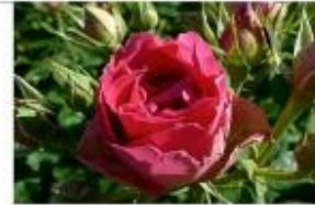
BRONZEMEDAILLE Nr. 90 Spanish Caravan Rojewski / PL 62 Punkte