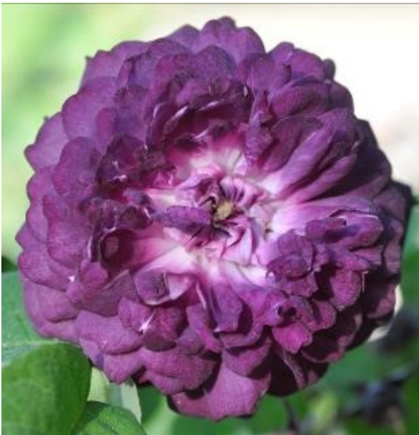
'Cardinal de Richelieu' (HGal, <1847)