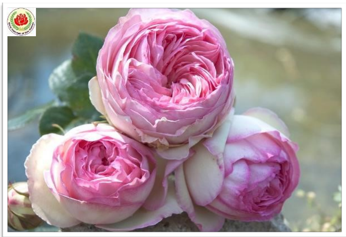
'Pierre De Ronsard®' aka Eden Rose® and Eden Climber™ (MEIviolin) 1976 cross, registered in 1985, inducted into the WFRS Hall of Fame in 2006