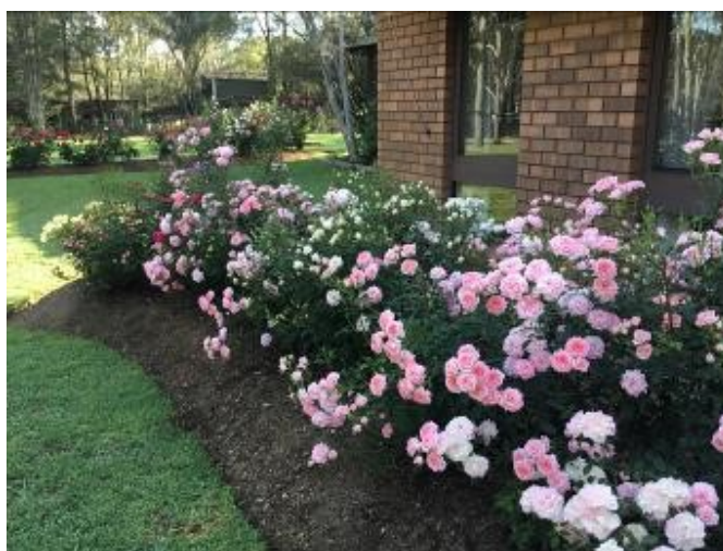
Left: Eucalypts in front of paddock, Right: Miniatures - in foreground, 'Delicious' bred by Eric Welsh

We were encouraged by our experiences and expanded our garden to include many new and favoured cultivars. Although the soil was heavy clay we worked hard to improve it with mulching. We found a source for duck manure and applied copious amounts. This built the beds up and provided nutrients.