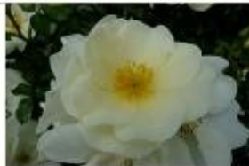
BRONZEMEDAILLE Nr. 94 Iwona Rojewski / PL 64 Punkte