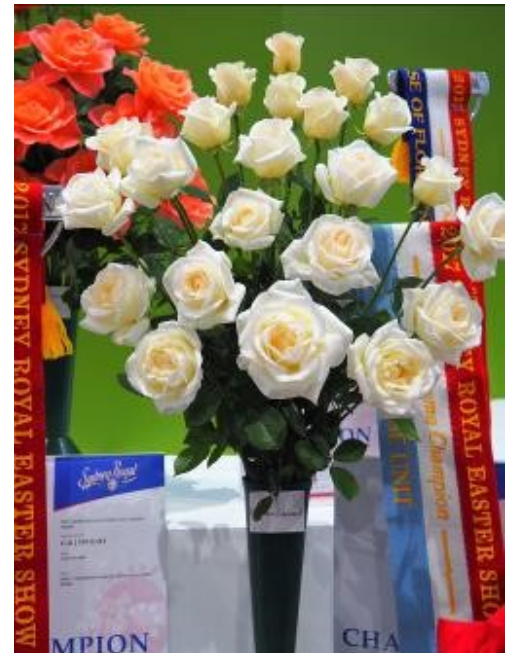
Left: 'Graham Thomas', Right: 'Dr Bruce Chapman' floribunda on the show bench