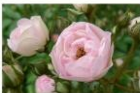
SILBERMEDAILLE Nr. 100 VEL17mpada Lens / B 67 Punkte