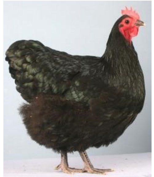
Left: Our garden, Right: Australorp pullet