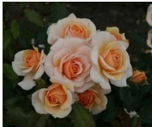
Left: Dickson test garden, Right: 2020 Rose of the Year winner 'Sweet Honey' by Kordes

Breeders who are members of the BARB are invited to send in their best rose. Other breeders, who have a representative as a member of BARB, and have a good rose are allowed to send in as well. For the rose of their choice they must think 6 years ahead. The total of rose varieties sent in varies between 15 and 25 each year. They are planted all over the country and in Northern-Ireland, and judged for a period of 2 years by independent amateurs and professionals. After 2 years one rose, the best, is selected. When the rose is subsequently sold all the breeders involved in the selection share in the profit. This ensures that the best rose will be chosen. The selected rose will become 'Rose of the Year', but only after four years. This allows the winning breeder to get enough starter budwood ready for the rose growers in the UK. These rose growers must take care to have the requested quantities ready at the moment of release.