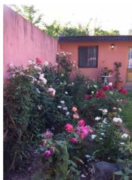
Left: Roses waiting to be moved from garden 2 to 3, Middle: 'Crepe de Chine' in garden 3, originally planted in garden 1 in 2005, Right: Boulogne garden Below Left: 'Constance Spry', Right: 'Félicité et Perpétue'