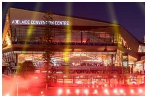
Left: Adelaide Convention Centre (ACC) and Elder Park, Right, Opening of the new West Wing of the ACC