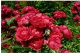
GOLDMEDAILLE Nr. 124 Perennial Red Domino Rosen Tantau / D 72 Punkte