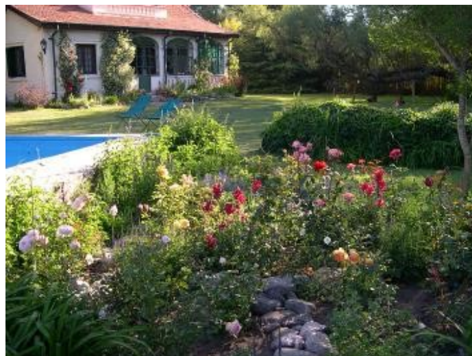
Las Higueras garden

As my experience with roses was null, my method was the old try / error one. My advice to new rose lovers is: before planting, visit nurseries, rose shows, friend's gardens, read books; study their growth habits and needs before buying the first one you fall in love with in the nursery (sometimes it can't be helped) to discover, once at home, you don't have the space to place it.