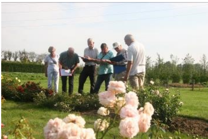
Judging Excellence Roses, Netherlands

From my own country, the Netherlands, comes the Excellence Roses quality mark, founded in 2013, with the aim to make the image of garden roses better, especially concerning its health, maintenance friendly, and multifunctional appliance. This trial is organized together with Belgium. The roses are planted at four locations, all Rosaria, three of them in the Netherlands, well spread over the country, and one in Belgium. Here again spraying with pesticides isn't allowed. Excellence Roses is an activity of the Culture Group for Roses and Rootstocks, under the secretariat Anthos.