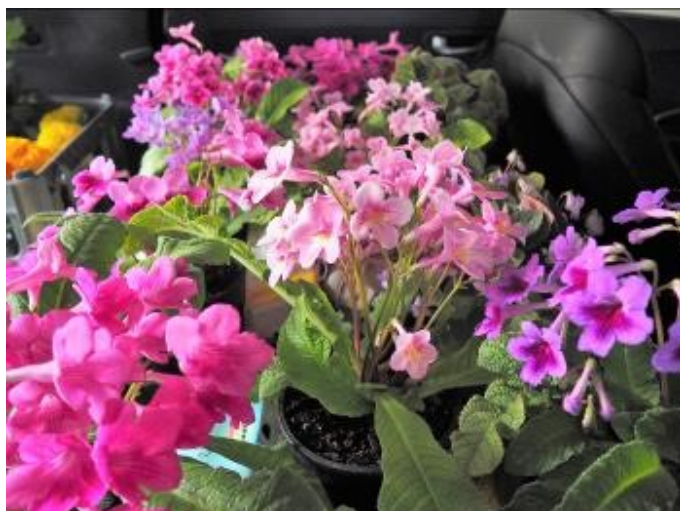
Left: Gloxinias, Right: Streptocarpus

For good measure we also have poultry (chickens). Just as the roses have international backgrounds we have Rhode Island Red Bantams (USA), Rosecomb Bantams (UK) and Australorps (Australia). The bedding from their sheds goes on the roses.