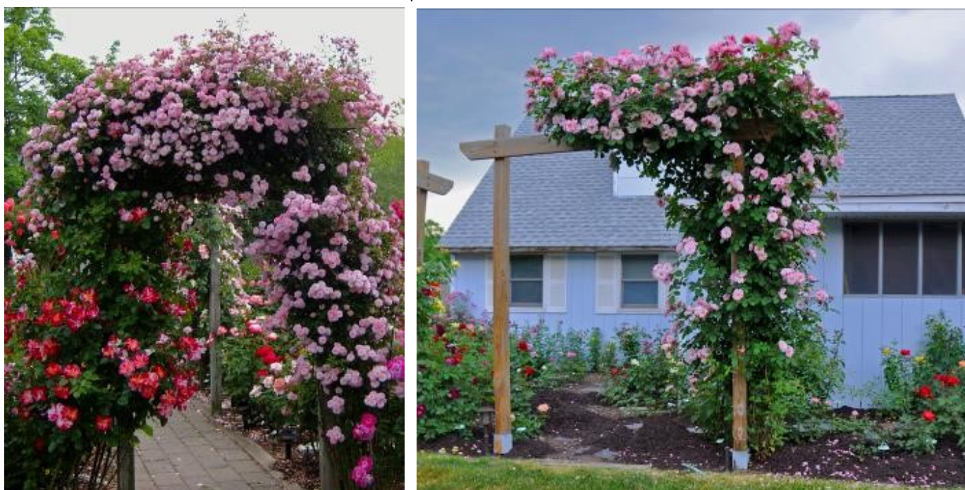
Left: 'Jeanne LaJoie', Right: 'Claire Matin'

On the opposite side of our house is a small square bed with miniature and miniflora exhibition roses, which sits between the rose rehab and our back patio. There is also a bed with some of our favorite and fragrant hybrid teas, so they are close to the patio, and we see them all the time when we go through to the front yard. The next bed before the front yard, is one made up of mostly red, orange and yellow roses. 'Florentina' is planted as a pillar rose along the fence, and 'Golden Gate' and 'Tangerine Skies' were planted on an arbor in the middle of the bed. There are some others mixed in, but the majority follow this theme. Along the side of the house, two 'Zephirine Drouhin' roses are trained along a wooden framework attached to the house. Since this is the north side of the house, it gets only morning sun, maybe four hours or more, two 'Knockout' and two 'Pink Knockout' were planted to replace hosta and astilbe planted there. They do fairly well there despite not a lot of sun, staying smaller and producing about a third of the blooms, that our full sun 'Knockout's do. This is way more color than the prior plants did, over a much longer time period.