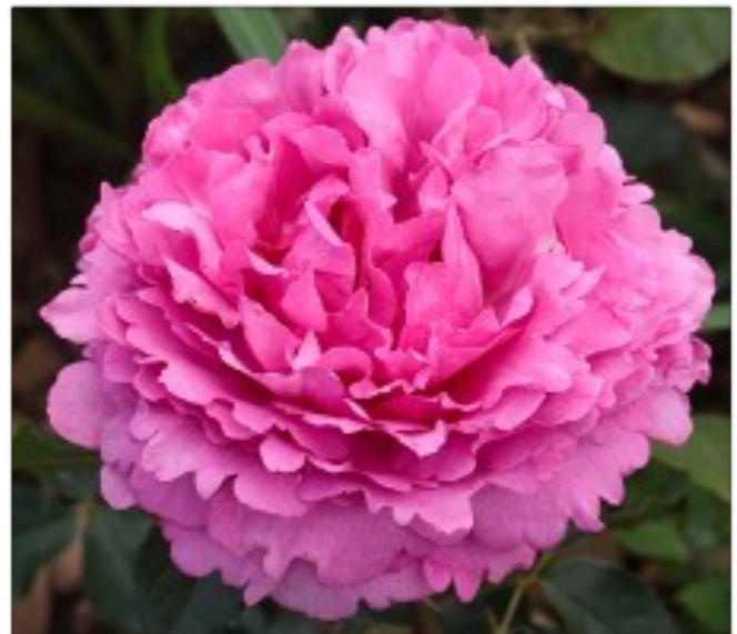
Left: 'Orange Meilandina'® (MEIjikatar), first of MEILLANDINA®/SUNBLAZE® series, 1974 cross, registered in 1982, Right: 'Yves Piaget'® (MEIvildo), 1975 cross, registered in 1985