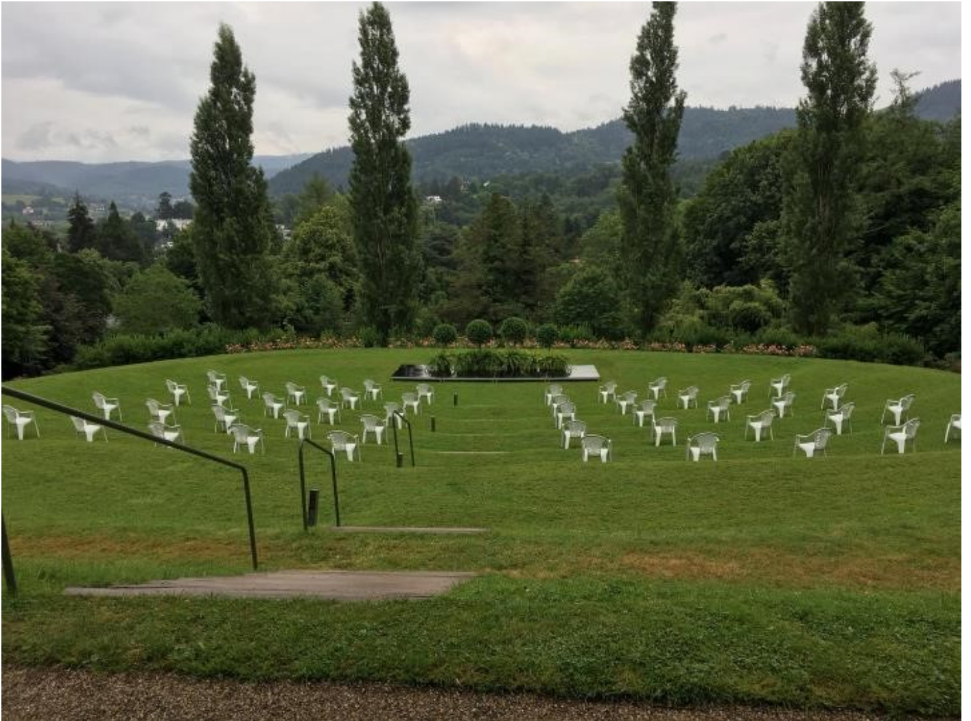
Social Distancing at Baden-Baden Rose Trials - 2020