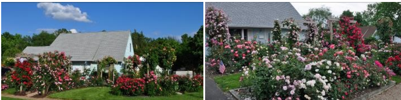
Kozemchak Garden front (l) and side (r)

We started our garden in 1989, the year after we bought our house. The first thing we did was to cut down two 35-foot pine trees on the corners of the house. There was also a long hedge of forsythia, weed trees, vines and other assorted plants along the back fence, about 8 foot wide. This was next to go. We planted some annuals, bulbs, and about ten roses in a 4' x 8' bed edged with 6" x 6" timbers. My father always had half a dozen bushes for my mother to cut roses from, so I wanted to do the same for Kathy. Wanting the roses to get off to a good start I put lots of fertilizer in the planting holes and gave them lots of water. At first, they grew well, then after a few weeks the roses turned brown, then black and died. Wanting to know what went wrong I bought a rose book, Roses: How to Select Grow and Enjoy by Richard Ray & Michael MacCaskey from HP Books. I found out that I shouldn't have put all that fertilizer in with new bare root roses. I also bought the Ortho book, All About Roses . These books had many beautiful pictures of different varieties that I wanted to grow, so the search was on. Next year the number had increased to around 20, and they were growing very well. The 4 x 8' bed had expanded to about 20' deep, and across most of the back of the house. Each year more were added until we had close to 100 bushes and roses were making their way to the sides and front of the house. The HP book had information on the American Rose Society so we joined the ARS in 1996.