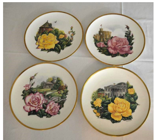
From left: RNRS silver dish, Franklin Mint rose plates, Boehm Pottery plates