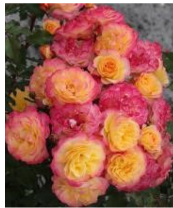
Left: Grand Prix judging, Right: 2020 Grand Prix winner 'Landlust' by Kordes

The results are published on the website of the SNHF, with complete information about the breeder, details of the plant and even the perfume, along with good pictures. And a beautiful magazine is made as well. Such positive activities all for the sake of the rose didn't go unnoticed, which resulted in invitations for judging at the WFRS trials in Baden-Baden, Barcelona and Le Roeulx.