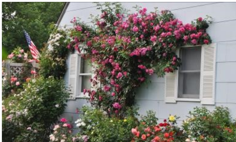
Left: 'Knock-Out' series bed, Right: Side of house with 'Laguna'

usually get a second feeding, about half of the spring amounts. After I fertilize, I put down a pre-emergent like Preen , Snapshot or corn gluten. They all seem to work similarly. A two-inch layer of mulch is applied over the fertilizer and pre-emergent. I do not remove any of the old mulch, it breaks down over time. I have been using the dyed brown mulch, because that's what is easily available to me, so I used extra fertilizer, as this type of mulch will deplete some nitrogen from the soil as it breaks down.