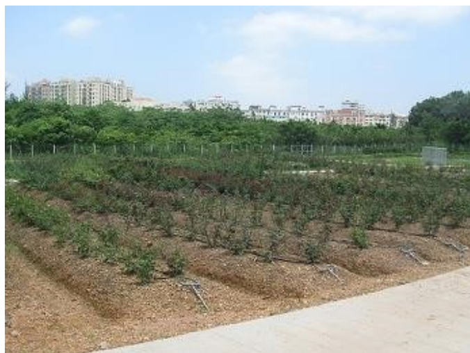
Left: Aerial view of the Shenzhen research station, Right: Test border with drip feed watering system