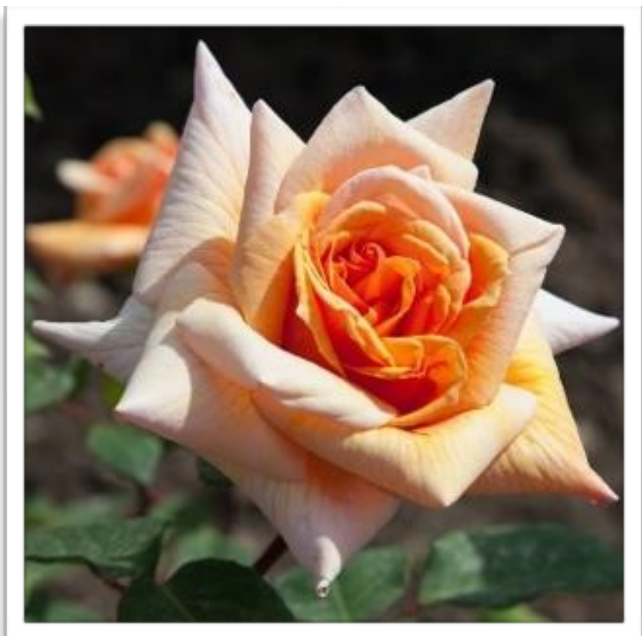
'Provence' 1935 cross, registered in 1945

All these varieties have been duly indexed and amongst them, we can particularly retain the following three varieties obtained by Manou before her marriage: