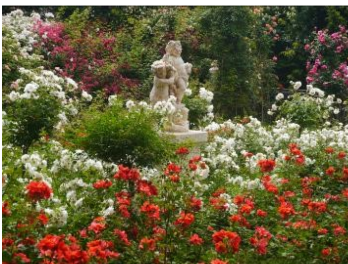
Left: Croix grand garden, Right: Autumn garden