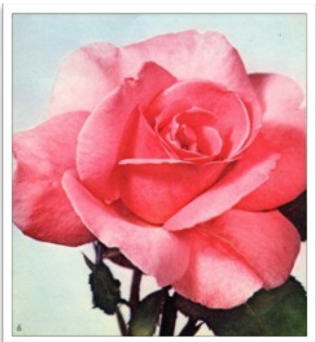
'Monique' 1937 cross, registered in 1947