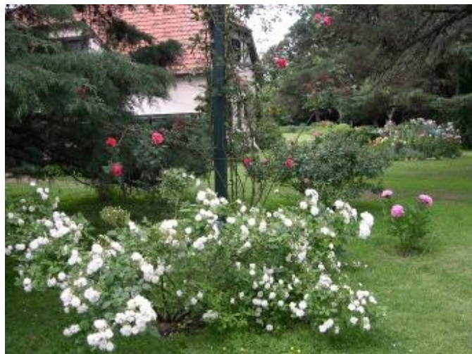
Las Higueras garden