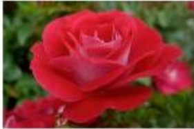
SILBERMEDAILLE Nr. 88 Corazon W. Kordes Söhne / D 68 Punkte