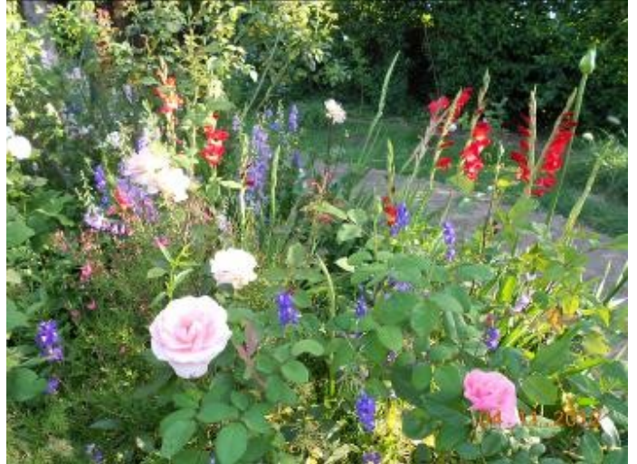
Lomas de San Isidro garden

The garden was a big narrow rectangle, so no secret gardens were created here. A big curved border embraced it, a brick path on one side led from entrance gate to the house, and there was an open garage on the other.