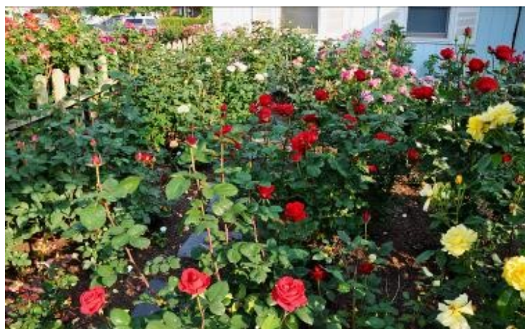
Left: Front gateway with 'Morning Magic' on right, 'Jeanne laJoie' center, Right: Hybrid tea bed