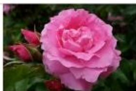
BRONZEMEDAILLE Nr. 112 Evesorja André Eve / F 61 Punkte