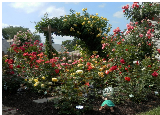
Left: Old garden rose bed, Right: Yellow, orange and red bed

On the other side of the shed are two beds that contain mostly miniatures and minifloras. The first one is the big sand boxes the kids used to play in when they were younger, and the shed sits where they used to have a large jungle gym. At the back of the first bed is a small deck area with a small table and chairs and lattice on top of supports for shade. The bed is also edged with supports for climbing roses. 'Open Arms', 'Ann's Rose', 'Irene Marie', 'Ruby Pendant', 'Cupid's Kiss', 'Bajazzo' and 'Moonlight' grow up on these supports. Along the back fence on the other side of the small deck are rugosas, r. rugosa , r. rugosa alba , two 'Scarobosa', and 'Topaz Jewel' The next bed is mostly exhibition miniature and minifloras, with the exception of a few hybrid bracteatas by Ralph Moore and a large 'Fourth of July' at the end of the bed.