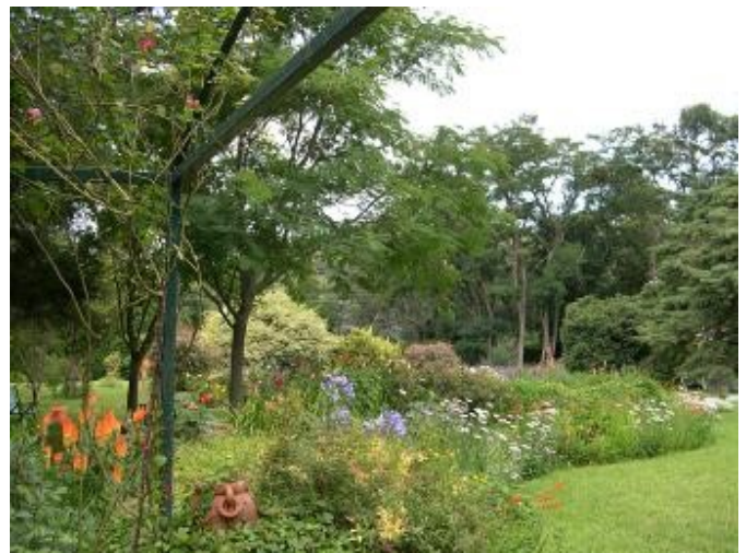
Las Higueras garden

Next spring, one of them gave me beautiful big pink, old fashion style roses. The other, clusters of pinkish buds, which opened as small, double white flowers and were strongly perfumed. So, I invited my friends, members of the local Rose club to see them and, to my great surprise, they turned out to be 'Constance Spry', Austin's first English rose, and 'Felicite et Perpetue', the hybrid sempervirens that somehow had survived more than 10 years of neglect. After the lady who had planted them passed away, her children no longer cared for the house nor the garden. Who said roses are difficult?