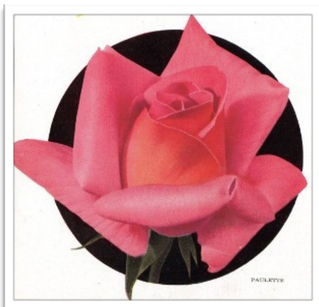
'Paulette' 1936 cross, registered in 1946