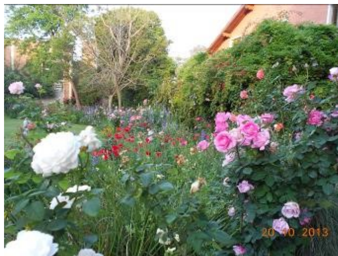
Lomas de San Isidro garden

My rose collection grew and grew, but nothing lasts forever, my husband passed away suddenly, and my children wanted me close to their homes again, so I had to move back to my Buenos Aires house. Obviously, I was not ready to leave my darlings behind and started to prepare them for the adventure. My local nursery owner advised me how to do it. We were in the middle of summer, with really high temperatures; not the best time at all, but it had to be done.