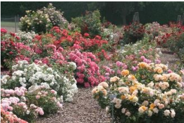
ADR test garden, Übersicht, Netherlands