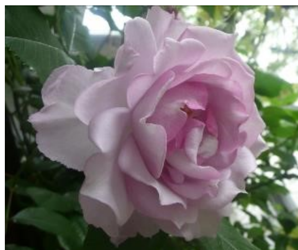
Left: 'Sourire d'Orchidée', Right: 'Délic'