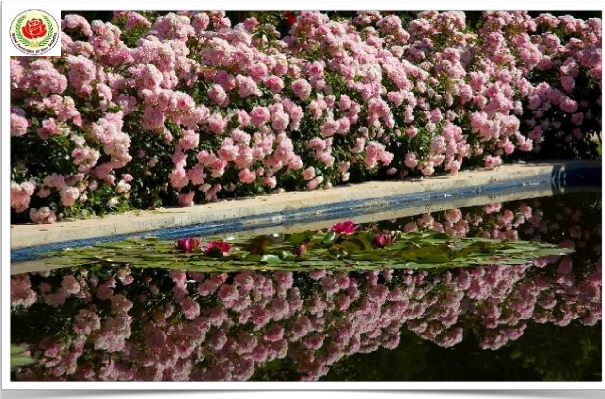
'Bonica®' (MEIdomonac), 1975 cross, registered in 1985, AARS 1987 winner, inducted into the WFRS Hall of Fame in 2003