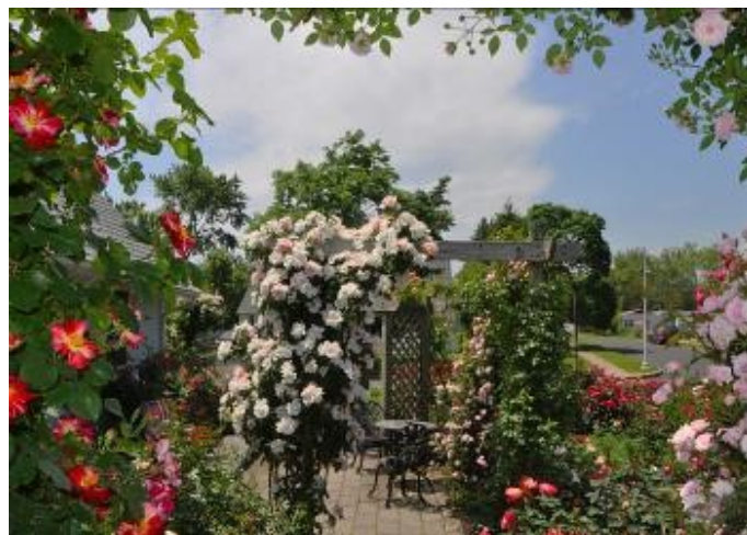
Left: Archway with 'Jasmina', Right: Patio garden from driveway view

Over the years, the remaining trees have been removed, making most of the garden, a full sun garden. Some had gotten too large, a couple started to die off, and another, a maple, would send out surface roots, 40- 50 foot away from the trunk, into the surrounding rose beds. These would form mats of roots that sucked up the nutrients and moisture from the soil, making many roses along the edges of the beds decline in health and vigor. These roots would stretch 20 foot or more from the canopy of the tree. After taking down this tree and removing the roots from the beds, most of the roses responded remarkably well. While they were dormant, I dug the ones on the edge of the bed out, removed the roots and amended and tilled the soil before replacing the roses. Some that were really suffering went to the rose rehab to try to recover, and some better varieties replaced them.