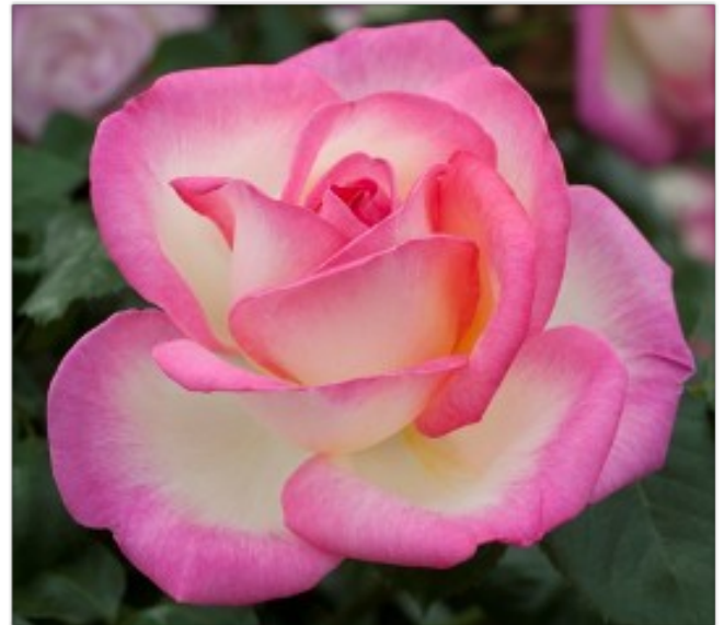
Left: 'Manou Meilland'® (MEltulimon) 1969 cross, registered in 1979, Right: 'Princesse De Monaco'® (MEImagarmic) 1971 cross, registered in 1982