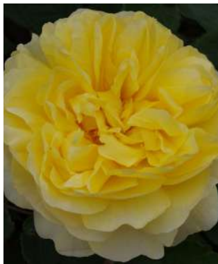
The Poet's Wife