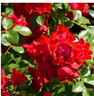
Black Forest Rose