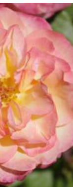
Ile de France