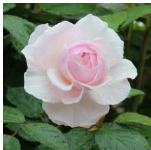
Olivia Rose Austin

Winx - The rose is impressive just like the mare. A vigorous, low growing shrub rose, it produces small clusters of 3-5 fully double, creamy white flowers. The flowers are retained for a long time on the bush and the healthy, dark green, glossy foliage creates an excellent contrast. Ideal for bedding and borders. The bushy growth habit, reaching approximately