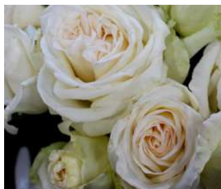
Coeur de Neige