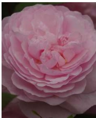
Olivia Rose Austin

The two new releases from David Austin had their debut at the 2014 Chelsea Rose Show. The Poet's Wife (AUSwhirl) is a superb shrub rose with strong, bright yellow blooms gradually fading as it ages. While the Austin