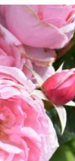
Ile de France