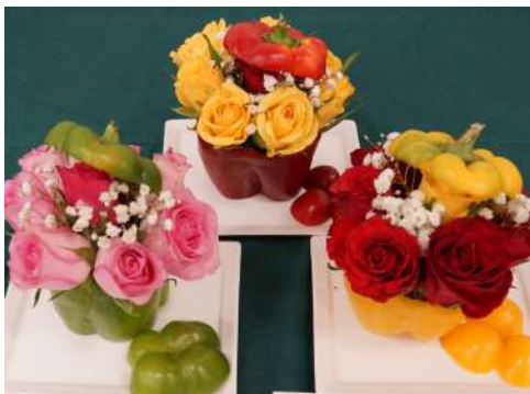
Table Arrangement (Floral) Exhibitor J. McCormick