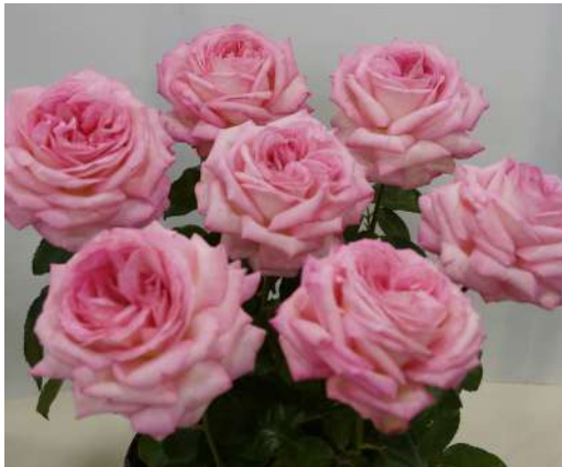
Code Name 'Minot' (Bowl) Exhibitor L. & S. Day