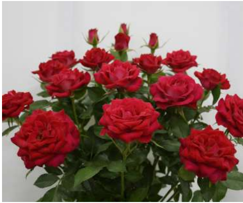
Red Gem (Bunch) Exhibitor G. Woods