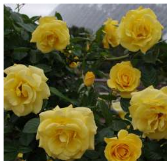
The High Life