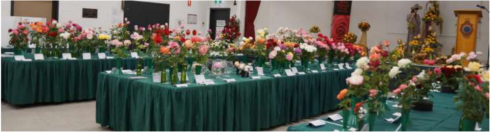
Magnificent display of roses at the Autumn Rose Show