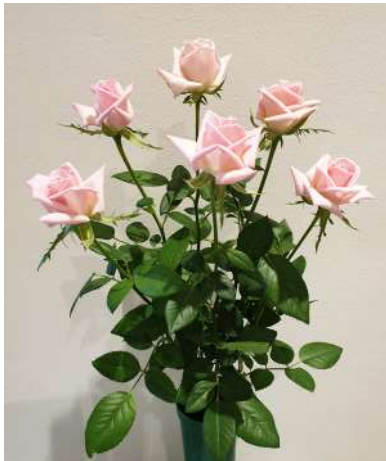
Baby Boomer, Grand Champion of the Enfield Horticultural Show.

This was the first collaboration with Enfield Society. It was a great success and we hope to continue to display our roses here in the future.