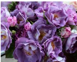
Blue For You