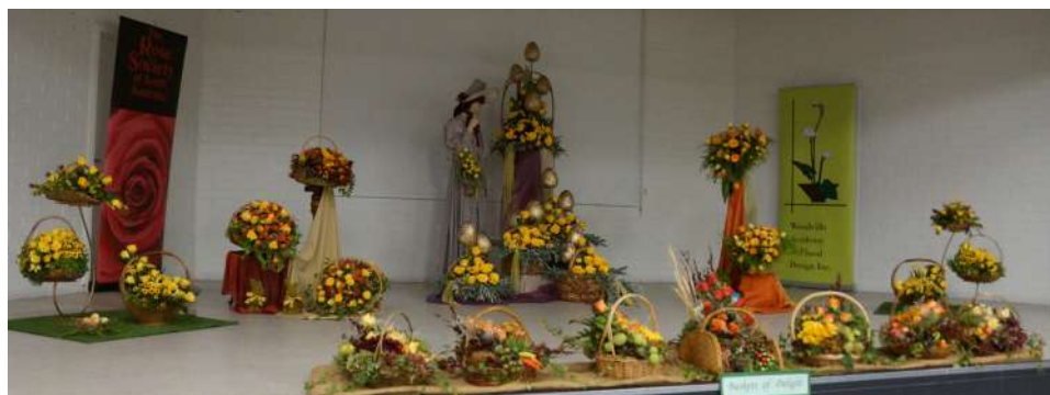
Woodville Academy of Floral Design Stage Display