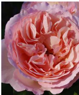
Princess Charlene De Monaco

catalogue recommends it for a position towards the front of the border the rose will grow readily to a bit more than a metre. Fragrance is strong and fruity with a hint of lemon.