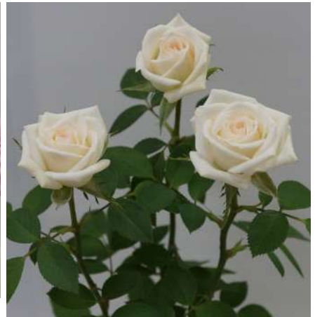
Irresistible (3 Stems Miniature) Exhibitor G. Woods