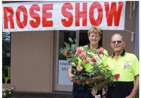
Noarlunga Orchids & Roses