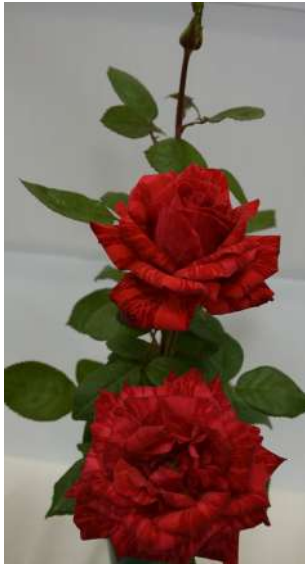
Red Intuition (3 Stage HT) Exhibitor P. & B. Burton