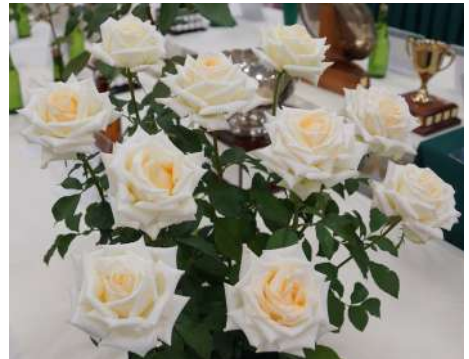
Angel View (Bowl) Exhibitor G. Woods