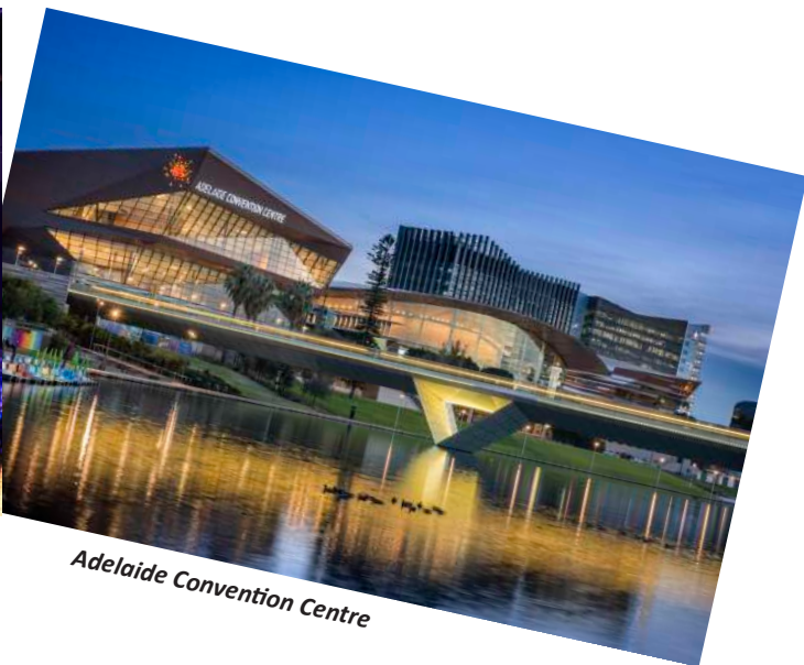
Adelaide Convention Centre