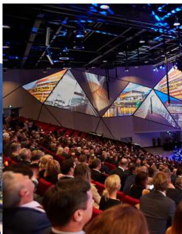
Adelaide Convention Centre

the city and surrounded by many great hotels. In fact, our official Convention Hotel will be announced soon. There are at least 15 hotels within one kilometre of the Convention Centre and several are just across the road. The Convention Centre is near Elder Park, the central hub of Adelaide's Arts and Entertainment district.