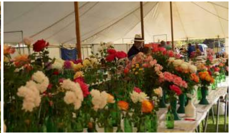
Above Right: Most of the blooms are now on the bench