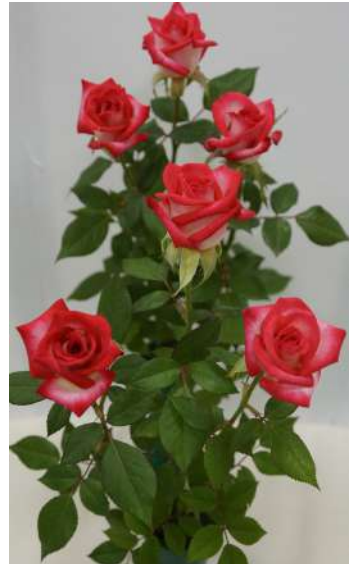
Magic Show (6 Stems Miniature) Exhibitor G. Woods