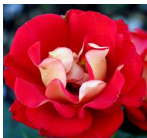
Ketchup & Mustard