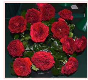
A Bowl of Roses