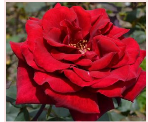
Full Bloom Rose