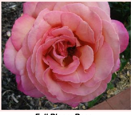
Full Bloom Rose