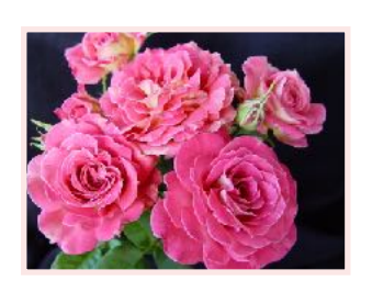
Australian Bred Rose