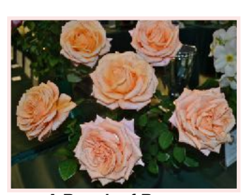
A Bunch of Roses

78 4 to 6 stems and/or cuts, a minimum of 10 blooms, NND.