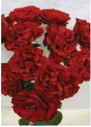
Dublin Bay (Sundry Class) Winner: B. Hosking