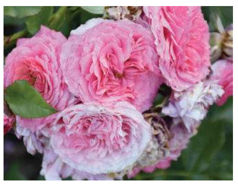
Certificate of Merit