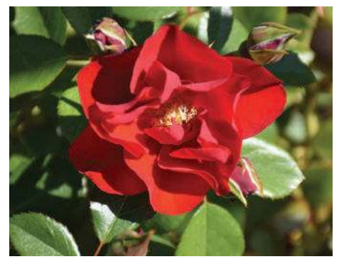
Gold Medal Name: Black Forrest Rose Type: Floribunda Breeder: Kordes, Germany