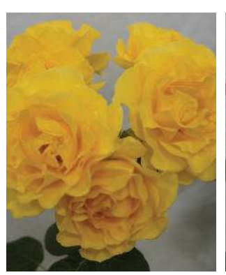
The Golden Child (Shrub) L. & S. Day