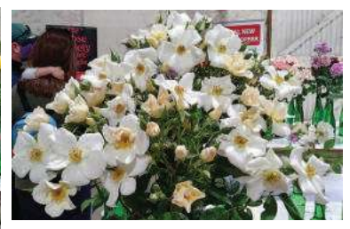
Bunch of Sally Holmes