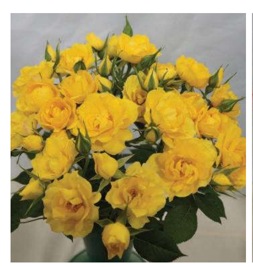
Golden Gardens (Miniature Bunch) Winner: P. & B. Burton