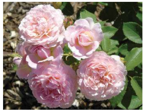
Certificate of Merit