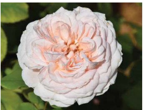
Certificate of Merit Name: The Lady Gardener