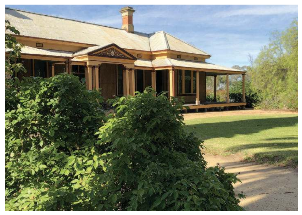
Bishop's Lodge Rose Garden - Hay, NSW, maintained by Chaffey Rose Club, Riverina group

We would like to wish you all a healthy and happy rosey festive season.