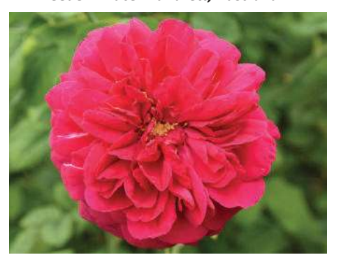
Bronze Medal Name: Thomas A Becket