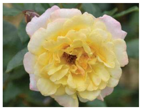
Silver Medal Code: KORmtsloar Type: Shrub Breeder: Kordes, Germany