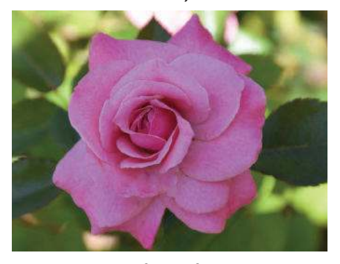
Certificate of Merit