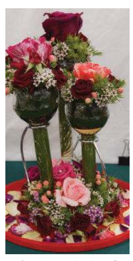
'Circles in Shades of Red' (Floral) Winner: N. Cargo