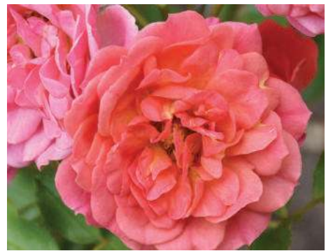
Silver Medal Name: Mandarin Type: Mini-Flora Breeder: Kordes, Germany