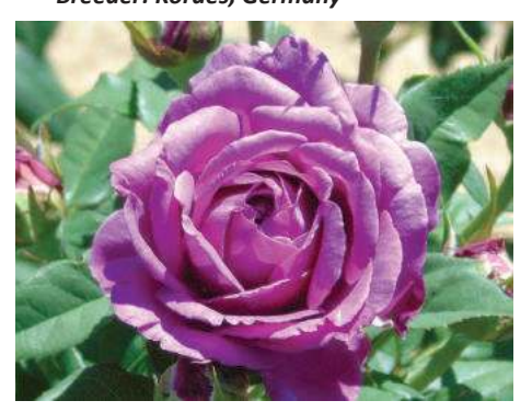
Silver Medal Name: Adorable Type: Floribunda Breeder: Kordes, Germany