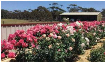
Simply Magic in full flush

The meeting was held on Sunday where approximately forty members of the Rose Society met at Waddikee Sports Club – some 45 kilometres west of Kimba. There were many blooms entered in the competition. Business formalities and question time were concluded by lunch time. We then travelled to the property of Geoff and Aileen Woolford, about six kilometres down the road.