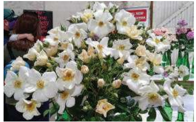
Bunch of Sally Holmes