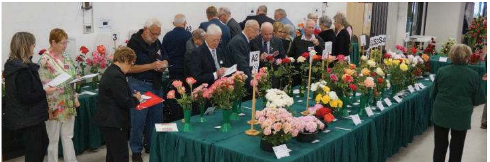
Judging exhibits at the 2019 Spring Rose Show 'Roses are Red'