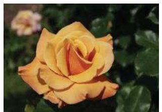
Singin' In The Rain