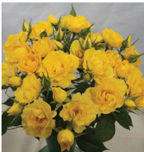
Golden Gardens (Miniature Bunch) Winner: P. & B. Burton