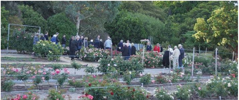
Group in the Rose Trial Garden of Australia