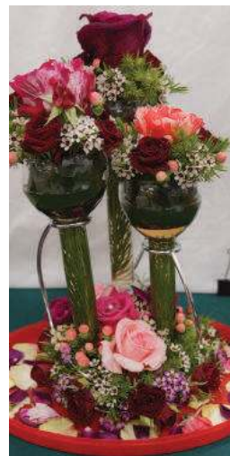
'Circles in Shades of Red' (Floral) Winner: N. Cargo