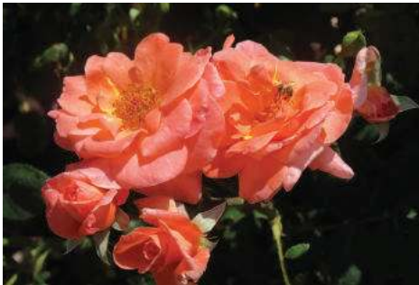
Elizabeth of Glamis