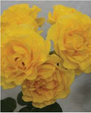
The Golden Child (Shrub) L. & S. Day