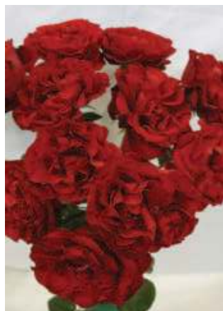
Dublin Bay (Sundry Class) Winner: B. Hosking