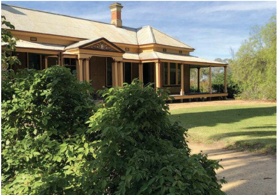
Bishop's Lodge Rose Garden - Hay, NSW, maintained by Chaffey Rose Club, Riverina group

We would like to wish you all a healthy and happy rosey festive season.