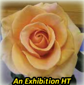
An Exhibition HT