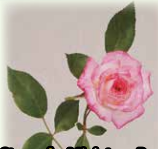
Stem of a Miniature Rose