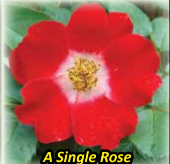
A Single Rose