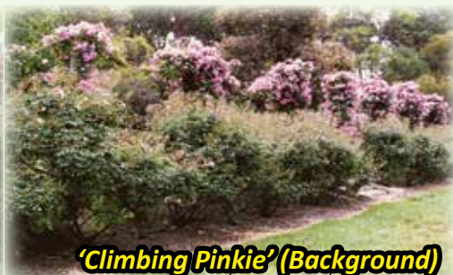
'Climbing Pinkie' (Background)