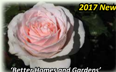
'Better Homes and Gardens'