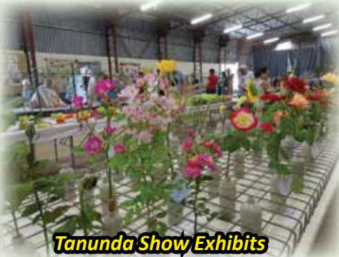
Tanunda Show Exhibits

Early March was quite busy with the Tanunda Show on Saturday 11 th . A great display of produce, craftwork, cooking, dahlias, children's section, horses, goats etc.