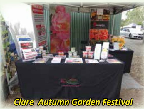
Clare Autumn Garden Festival

On Sunday, 12 th March we ventured to Clare for their annual Autumn Garden Festival