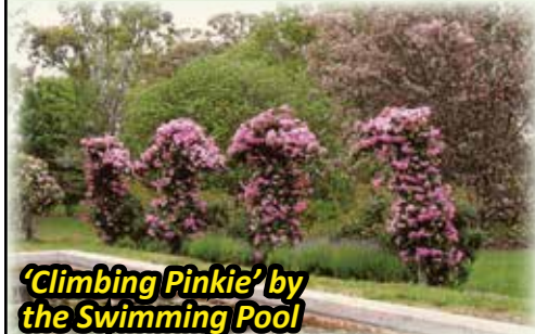
'Climbing Pinkie' by the Swimming Pool