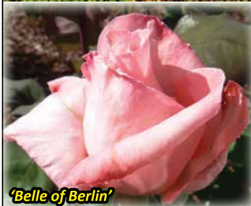
'Belle of Berlin'