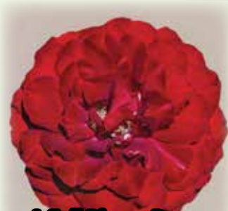
A Full Bloom Rose