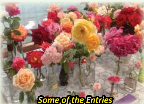
Some of the Entries

The colder the x-ray table, the more of your body is required to be on it. Everyone has a photographic memory; some just don't have film.