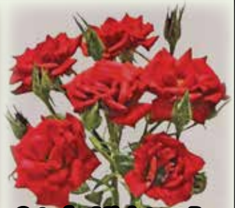
Cut of a Miniature Rose