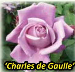
'Charles de Gaulle'