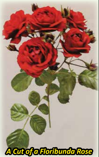
A Cut of a Floribunda Rose