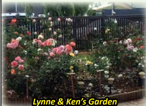
Lynne & Ken's Garden

OUR NEXT MEETING IS PLANNED FOR COWELL ON THE 7 TH OF MAY 2017