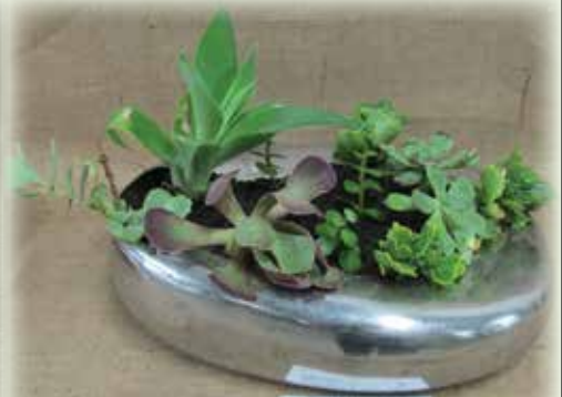
Most Unusual Container