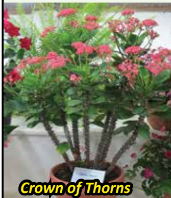
Crown of Thorns