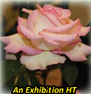
An Exhibition HT