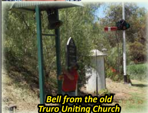
Bell from the old Truro Uniting Church

The setting was perfect, a lovely grassed area under the gum trees overlooking the "pool" to the surrounding area. Lots of vintage signage was placed around the area & an old looking hut housed kitchen & bathroom facilities. A bell from the