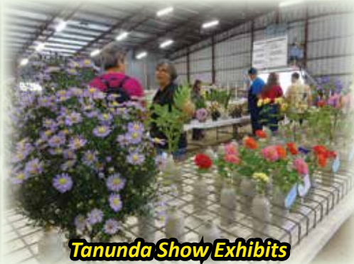
Tanunda Show Exhibits