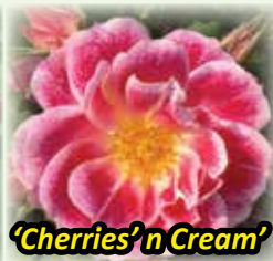
'Cherries' n Cream'