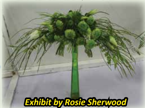
Exhibit by Rosie Sherwood

The floral work was exceptional as usual, with two of our members receiving prizes including "Most Creative Floral Exhibit" being awarded to Penelope Schulz for her Pave design. The cut flowers section was down a little on last year but still a good display & many prizes were received by our members.