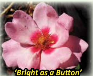
'Bright as a Button'