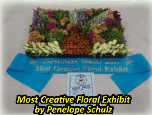
Most Creative Floral Exhibit by Penelope Schulz