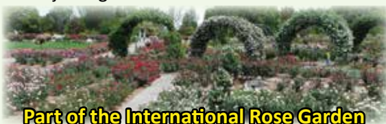
Part of the International Rose Garden