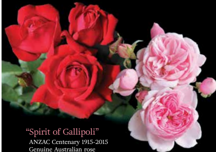
"Spirit of Gallipoli"

ANZAC Centenary 1915-2015 Genuine Australian rose